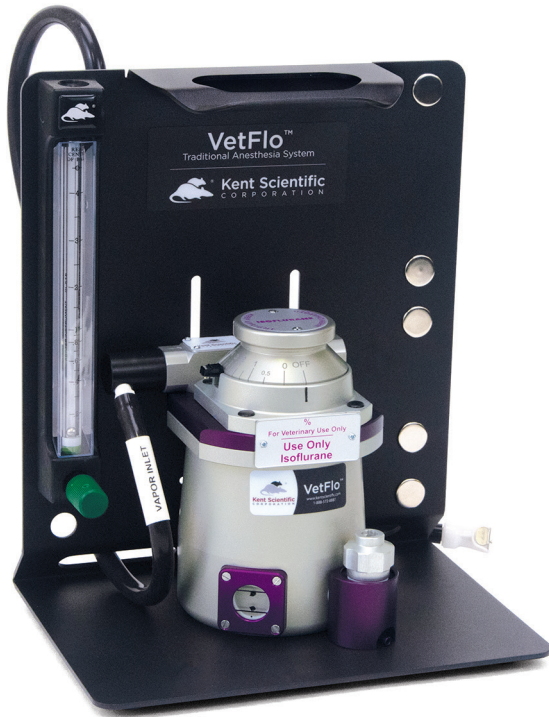
VetFlo vaporizer with single channel anesthesia stand